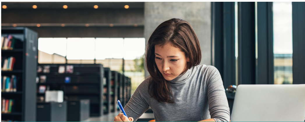
LIBRARY AND LEARNING SUPPORT

The Learning Management System (LMS) and Managing Student Placements Software (SONIA) will provide access to various learning technologies for both students and staff. These technologies will be appropriately supported to ensure that necessary resources are available to achieve learning and teaching goals. The e-Library can be accessed by staff and students at any time while on the campus or remotely. Security will be maintained by access controls such as unique login and passwords and firewall protective systems.