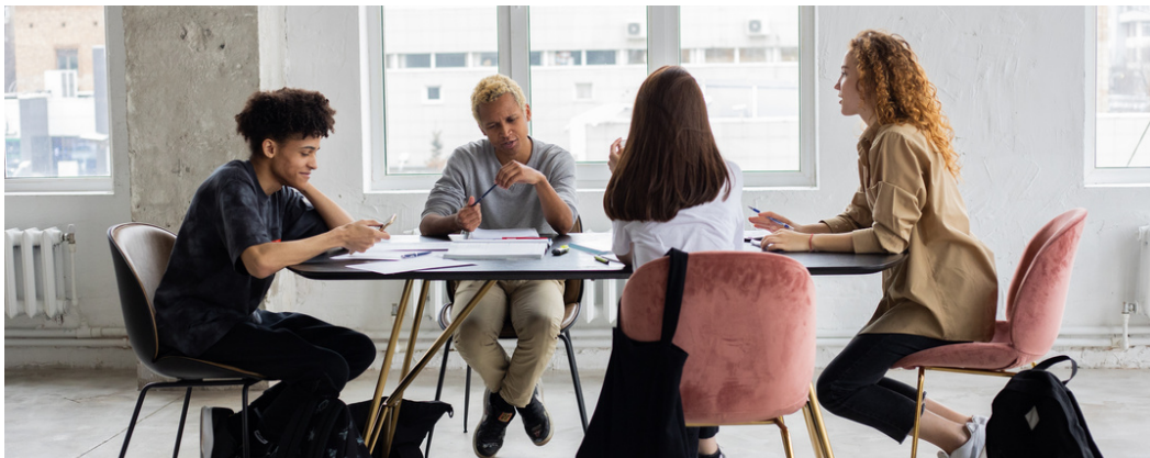
STUDENT ADVISORY GROUP (SAG)

LIHE provides support services for students to assist them in developing approaches to address factors impacting their academic progress. Students may contact the Student Support Manager, who will arrange a consultation time between the student and the staff members. Academic staff may also provide assistance with personal problems but are required to refer cases to the Student Support Manager when professional assistance is needed.