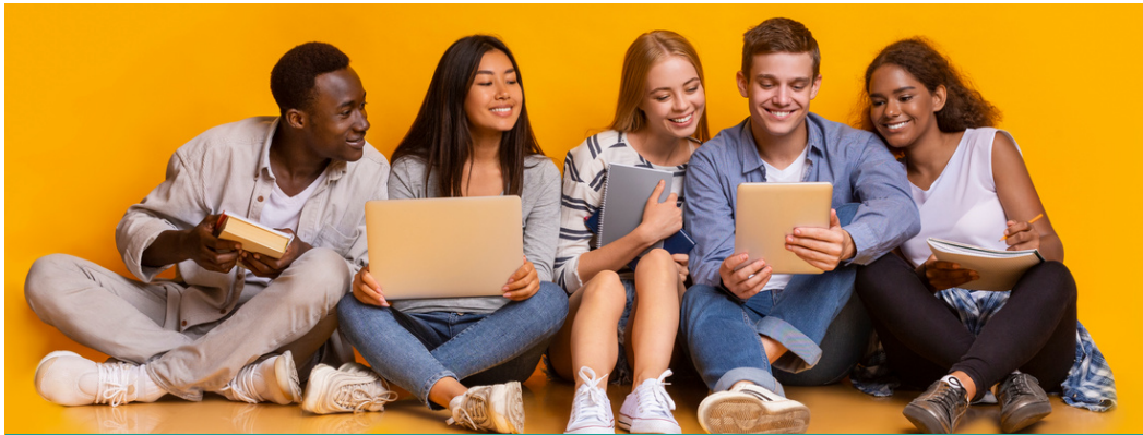
STUDENT SUPPORT STAFF

The Learning Management System (LMS) and Managing Student Placements Software (SONIA) will provide access to various learning technologies for both students and staff. These technologies will be appropriately supported to ensure that necessary resources are available to achieve learning and teaching goals. The e-Library can be accessed by staff and students at any time while on the campus or remotely. Security will be maintained by access controls such as unique login and passwords and firewall protective systems.